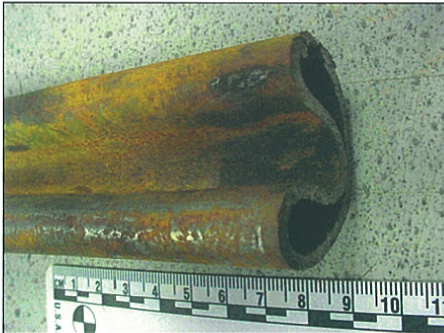
Figure 2: As recieved – Orthogonal view of the deformed end of the supplied sample (right side of Figure 1). The deformation is most likely the result of collapse. Scale minor dimension is in mm.