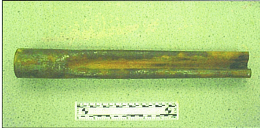
Figure 1: As recieved - Overall view of the sample (deformation is on the right).